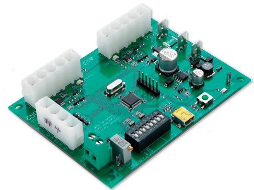
PWM board used to support EC motor operation within Fan coils.

* Fan coils designated to operate with variable air volume capabilities require proper controls/sensors to ensure reliable operation.