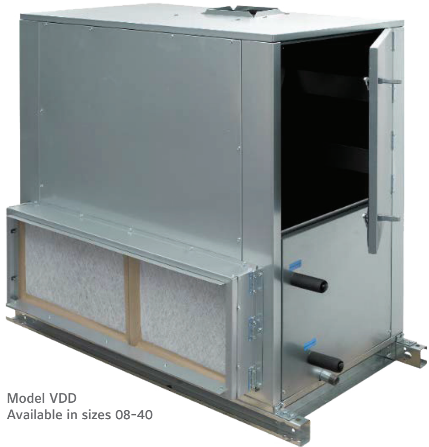
Model VDD Available in sizes 08-40